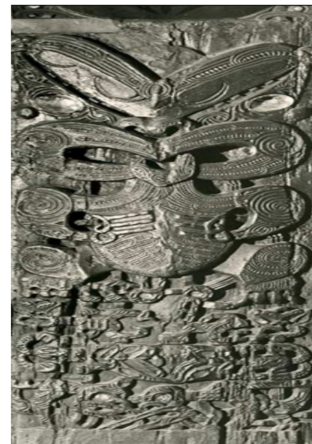
Te Ao Kapurangi